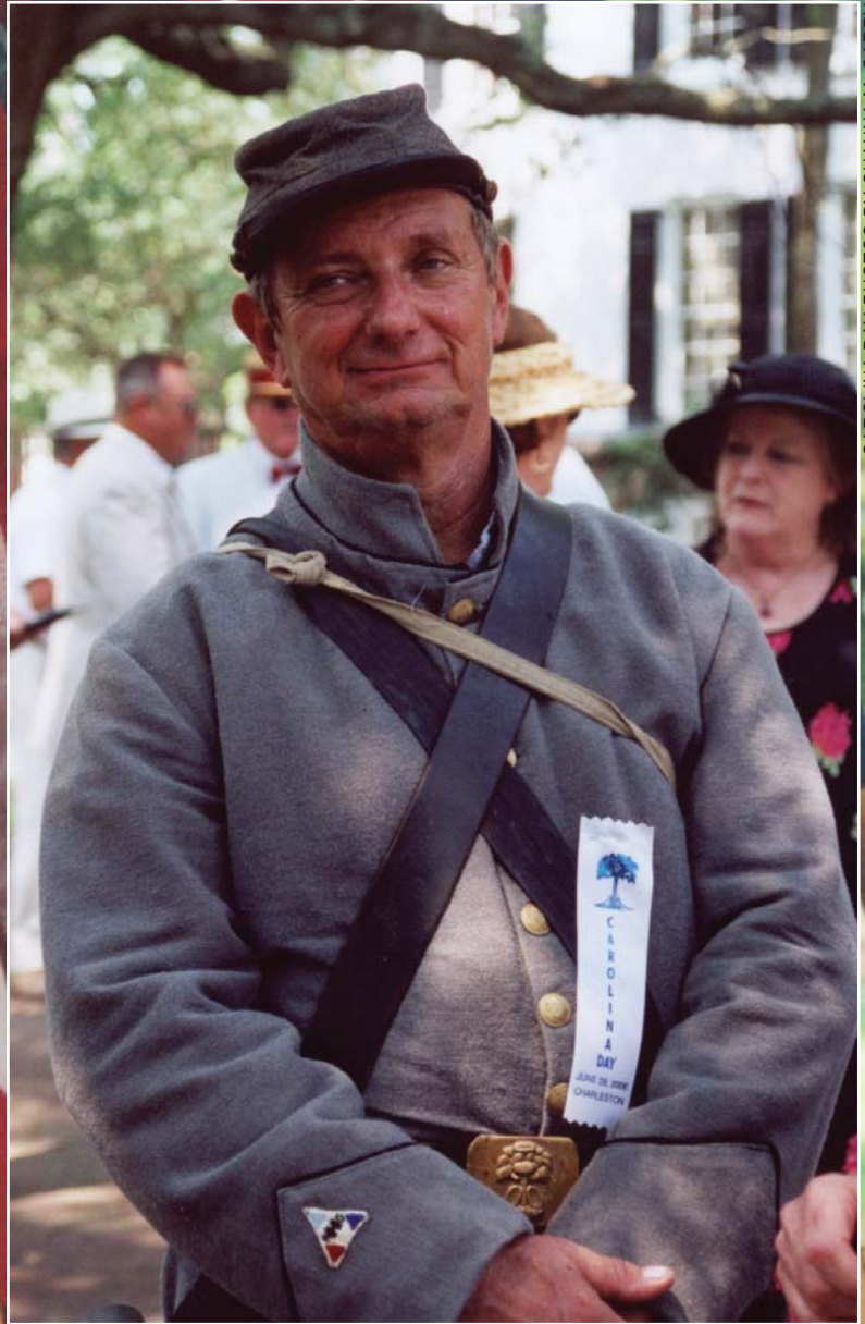
CAROLINA DAY