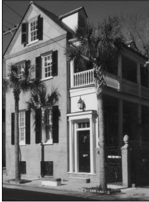
28 WENTWORTH STREET GARDNER-BASS HOUSE Constructed circa 1838

Please join us at the Fireproof Building for a reception following the tour, 4:00 - 6:00 p.m.