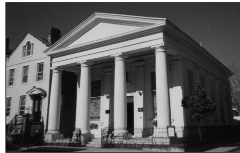
48 HASELL STREET ST. JOHANNES LUTHERAN CHURCH Constructed circa 1842