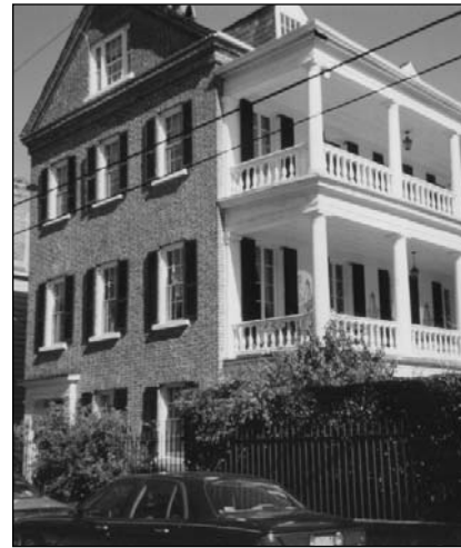
72 ANSON STREET KOHNE-LESLIE HOUSE Constructed circa 1846

Seventy-two Anson Street is located in the heart of Charleston's first suburb. The present house was completed around 1846 and reflects the Greek-revival architecture popular among Charleston's merchant class at the time. This handsomely proportioned residence is two-and-one-half stories on a high basement, with piazzas overlooking a large garden. The Neufville family built the home, and it remained in the family until 1904. After a fire in 1962 destroyed the first floor, the house was renovated extensively, and well-known landscape architect Loutrel Briggs was commissioned to design a garden. The present owner is an enthusiastic gardener and has added subtropical varieties to the graceful design.