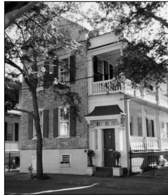
43 WENTWORTH STREET ST. ANDREWS LUTHERAN CHURCH Constructed circa 1834

This home is a brick single house built immediately after the fire of 1838. Recent research has uncovered construction workers' records that indicate it was the first of seven single houses built at the eastern end of Hasell Street. The property contains a main house and carriage house. It has had six owners in 150 years. The current owners have attempted no major structural alterations to the house. Instead, they have chosen to uncover and retain as many of the original features as possible. Research has shown that the carriage house survived the 1838 fire and perhaps dates to the early nineteenth century.